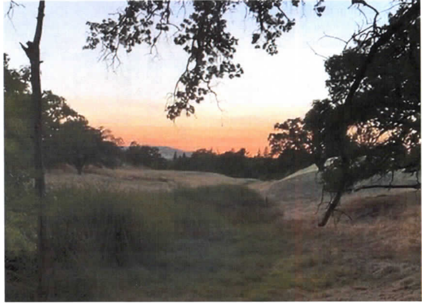
Seven Hills Ranch – 90% of its trees will be cut down to accommodate development. Website with opposing info and petition: savesevenhillsranch.org .