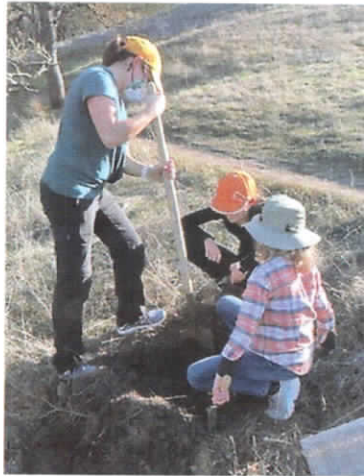
Acorn Planting Day – Volunteer oak planting team prepares soil for acorn-planting. Many families volunteered for this restoration activity sponsored by the Open Space Foundation.

We planted acorns in the flagged areas previously selected and marked. We had earlier prepared the sites by scraping a two-foot circle in the grass.