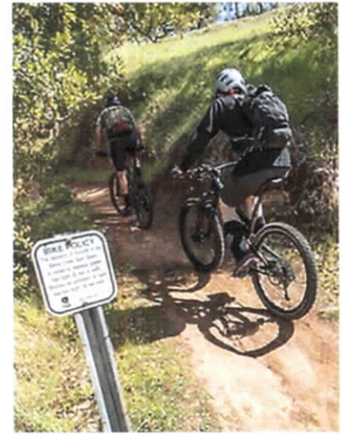
Not Infrequent – Cyclists ignore sign, at North Lime Ridge.

When designed for sustainability, open space staff aims for sustainability. For example, the path must be laid out and oriented on slopes minimize erosion. Erosion ruts damage the trail bed, making the trail less enjoyable for any use. Silt from erosion disturbs and reduces habitat for wildlife.