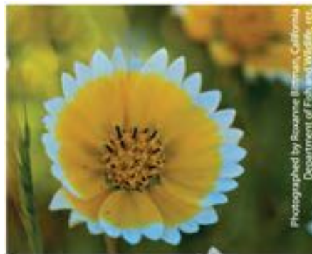
Beach layia ( Layia carnosa ) a state and federally-endangered plant. CA LCP previously funded a project to assess and map rare plant species vulnerable to climate change.

CA LCP welcomes organizations to join as partners or via an ad hoc working group.