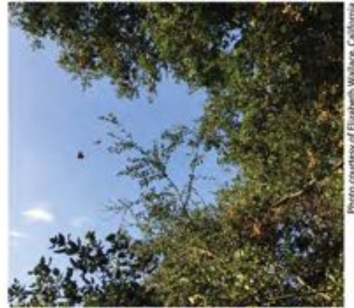
Two monarch butterflies under a coast live oak tree. California's overwintering population of monarch butterflies ( Danaus plexippus pop. 1) is a candidate for federal Endangered Species Act protection.