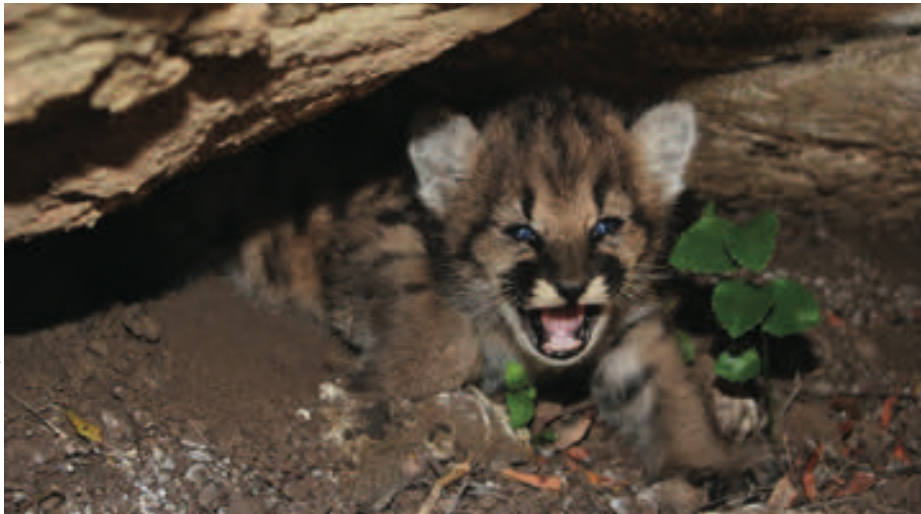
Mountain lion kitten with oak seedling. (In June of 2018, National Park Service researchers discovered a litter of four female mountain lion kittens in Simi Hills, in a small area of habitat wedged between larger Santa Monica and Santa Susana mountain ranges. The kittens are known as P-66, P-67, P-68, and P-69. Their mom is P-62.)