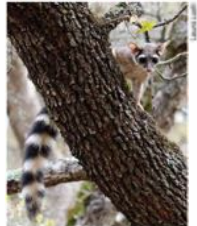
Ringtail ( Bassariscus astutus ) peeking from behind an oak trunk at Sutter Buttes. Ringtails are fully protected in California.

Reptiles Gambelia sila blunt-nosed leopard lizard, endangered (f, s) and fully protected • Masticophis lateralis euryxanthus Alameda whipsnake, threatened (f, s) • Thamnophis gigas/Thamnophis couchi gigas giant garter snake, threatened (f, s) • Thamnophis sirtalis tetrataenia San Francisco garter snake, endangered (f, s) and fully protected